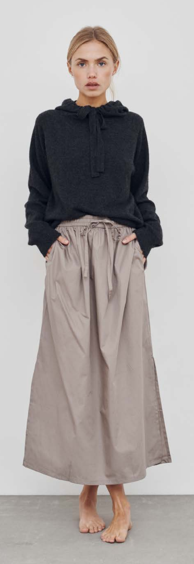
Cathy hoodie Lina skirt