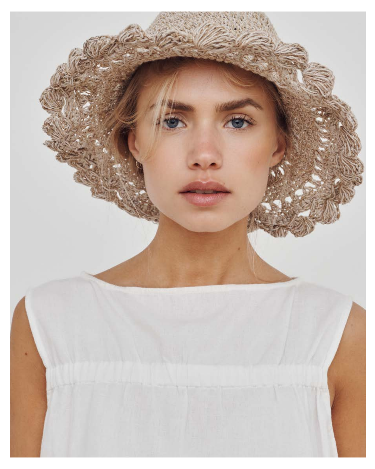
a nordic mindful way of life embrace nature - love people - seek balance