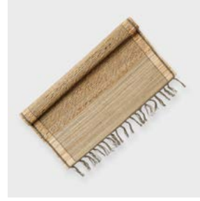
Balance mat & rug

We love the idea of combining two natural materials making these wonderful products. Local banana leaves harvested by hand and our GOTS certified organic cotton.